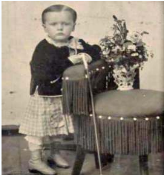
Paul Harris at age 3