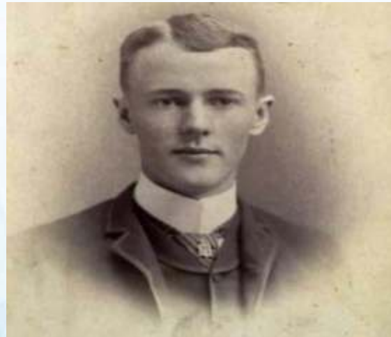
Paul Harris as a student at the University of Vermont

In 1892, he worked as a manual laborer on a fruit ranch and then worked in a raisin-packing plant. Harris was also a teacher at the L.A. Business College. Then he moved to Denver, Colorado, where he was an actor in a stock company, a reporter for the Rocky Mountain News , a cowboy, and a reporter for The Republican . After moving to Jacksonville, Florida, where he worked as a night clerk at the St. James Hotel, a traveling granite/marble salesman.